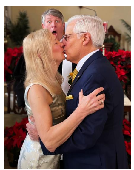
We staged a funny photo afterward