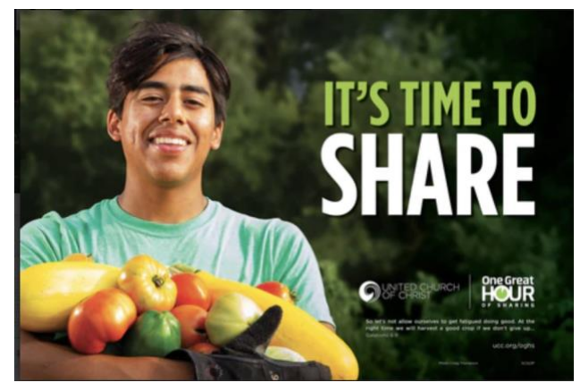
"This little light of mine, I'm gonna let it shine... Let it shine, let it shine, let it shine..."

You're here to be light, bringing out the Godcolors in the world. Matthew 5:14-15