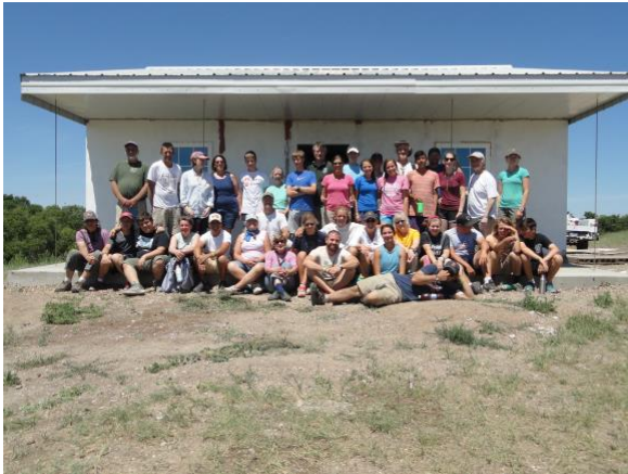
2016 Mission Trip to the Rez in South Dakota

What's happening with our volunteer programs - With many eagerly planning their summer and fall schedules, we wanted to provide an update on our volunteer programs: We are not yet able to bring back our volunteer opportunities, and we likely won't be able to do so for several years.