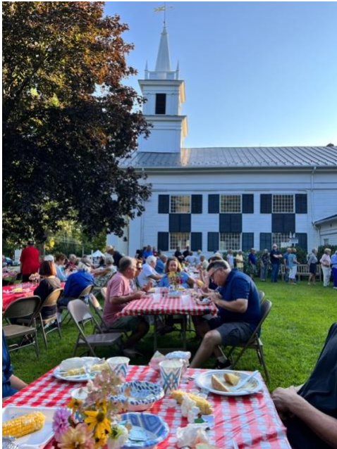
A view of this year's BBQ