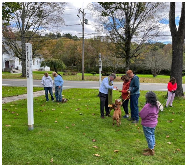
A scene from the October 11th Blessing of the Animals

For help with creating Pocket Prayer Squares, please speak with Jan Steers, 860-354-7210